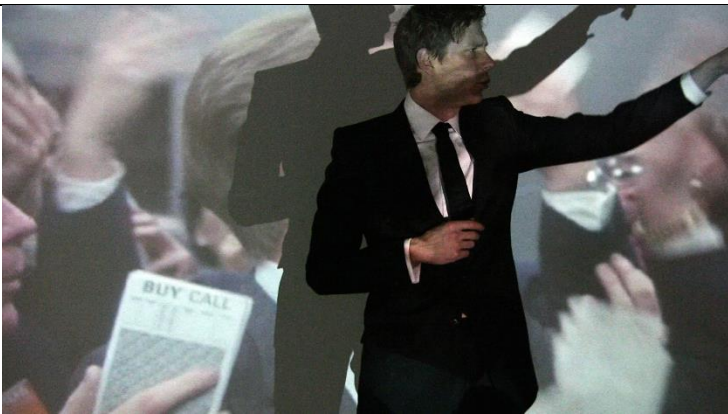
Chelsea Knight b. 1976, Randolph, VT, US Lives and works in New York, NY, US Don't Tread On Me , 2011 Two-channel video installation, sound, color; 20 min Courtesy the artist and Aspect/Ratio Projects, Chicago