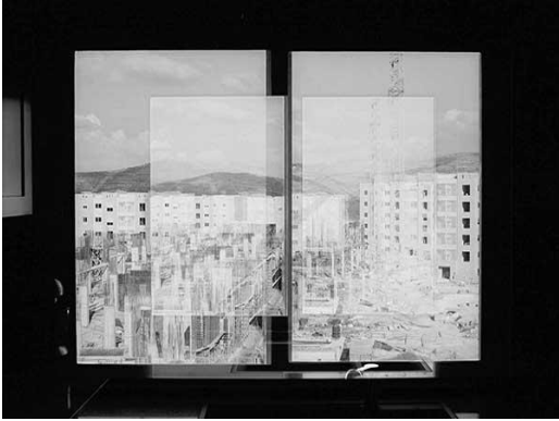
Nir Evron Threshold (Frame no. 18) , 2015 Inkjet pigment print on archival paper analogue 35 mm camera stills Framed, black and white, exhibition copy 19 11/16 x 27 9/16 in (50 cm x 70 cm)