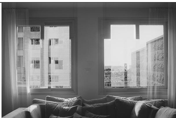
Nir Evron Threshold (Frame no. 10) , 2015 Inkjet pigment print on archival paper analogue 35 mm camera stills Framed, black and white, exhibition copy 19 11/16 x 27 9/16 in (50 cm x 70 cm)