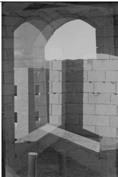
Nir Evron Threshold (Frame no. 24) , 2015 Inkjet pigment print on archival paper analogue 35 mm camera stills Framed, black and white, exhibition copy 27 9/16 x 19 11/16 in (70 cm x 50 cm)