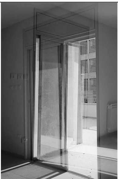
Nir Evron Threshold (Frame no. 14) , 2015 Inkjet pigment print on archival paper analogue 35 mm camera stills Framed, black and white, exhibition copy 27 9/16 x 19 11/16 in (70 cm x 50 cm)