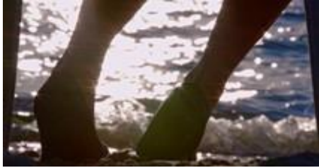
Diary of a Madman (Dead Horse Bay), 2016 HD video, stereo sound, color; 5:11 min