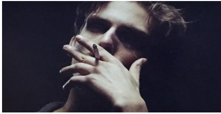
Diary of a Madman (The Drunkard) , 2016 HD video, silent, color; 5:48 min