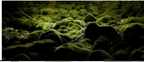
Diary of a Madman (Circadian Rhythm) , 2016 HD video, silent, color; 3:16 min Courtesy the artist, K11 Art Foundation, and Galerie Urs Meile, Beijing and Lucerne