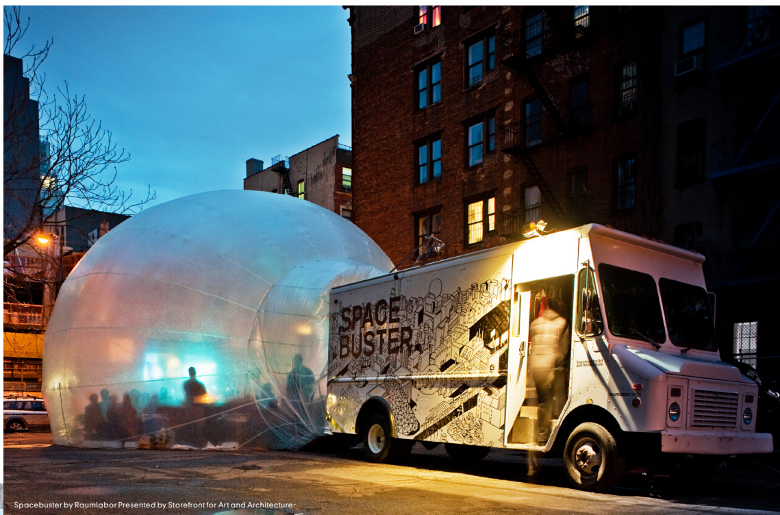
Spacebuster by Raumlabor Presented by Storefront for Art and Architecture

Author Cathy Erway offers a cooking demo using spring dandelion greens foraged from the city's parks and spicy arugula grown on her rooftop garden to make pesto.