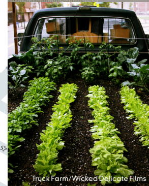
Truck Farm/Wicked Delicate Films