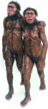
Tim & Sue Noble & Webster Masters of the Universe , 1998-2000 Translucent resin, fiberglass, plastic, and human hair 54 x 27 x 31 in (137 x 68.5 x 78.7 cm)