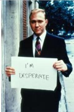
Gillian Wearing Signs That Say What You Want Them to Say... , 1992-93 Chromogenic print 47 1/4 x 31 3/8 in (120.1 x 79.7 cm)