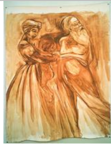
Kara Walker John Brown , 1996 Gouache on paper framed, 72 1/4 x 56 1/4 in (framed, 143 x 164 cm)