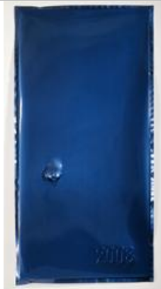
Seth Price Untitled , 2008 Vacuum formed high impact polystyrene and synthetic enamel 96 x 48 in (244 x 122 cm)