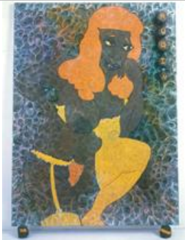
Chris Ofili Rodin... The Thinker , 1997 Acrylic, oil, resin, glitter, map-pins, and elephant dung on canvas 96 x 72 x 5 1/8 in (244 x 183 x 13 cm)