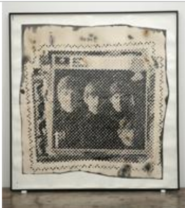
Dave Muller January 2007, According to NY Times (with the Beatles) , 2006 Acrylic on paper 83 1/2 x 79 1/2 in (212 x 201.9 cm)