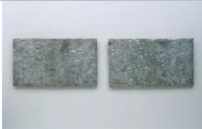
Kiki Smith Untitled (Skin) , 1992 Cast aluminium each, 28 1/4 x 50 1/4 in (each, 71.7 x 127.6 cm)