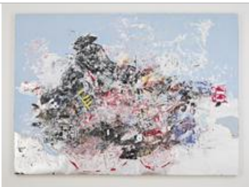
Mark Bradford Let's Make Christmas Mean Something This Year , 2007 Mixed mediums collage on canvas 102 x 144 in (259 x 366 cm)