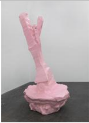
Franz West Gartenpouf , 2007 Styrofoam, epoxy resin and synthetic resin varnish 114 1/4 x 63 x 63 in, approximately 331 pounds (290 x 160 x 160 cm, approx. 150 kg)