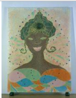
Chris Ofili Inner Visions , 1998 Acrylic, oil, polyester resin, glitter, collage, map-pins, and elephant dung on canvas 96 x 72 in (243.8 x 182.8 cm)