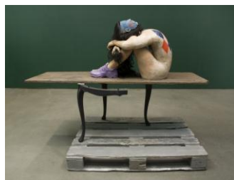
Andro Wekua Sneakers 1 , 2008 Wax figure, aluminum casted table and palett, Akrystal board, and ceramic shoes 59 x 72 7/8 x 39 3/8 in (150 x 185 x 100 cm)