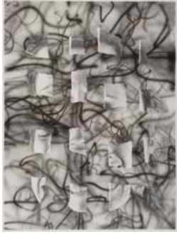
Jim Shaw Untitled (Ripped Face Drawing) , 2003-04 Pencil on paper 80 x 60 in (203.2 X 152.4 cm)