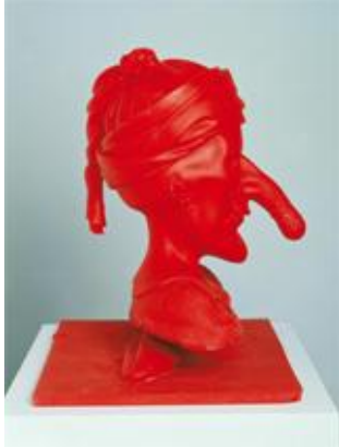
Paul McCarthy Untitled (Jack) , 2002 Red silicon rubber 23 5/8 x 23 5/8 x 18 1/8 in (60 x 60 x 46 cm)