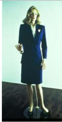
Charles Ray Fall '91 , 1992 Mixed mediums 96 x 26 x 36 in (244 x 66 x 91 cm)