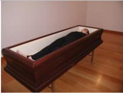
Maurizio Cattelan Now , 2004 Polyester resin, wax, human hair, clothes, and wood 33 1/2 x 88 5/8 x 30 3/4 in (85 x 225 x 78 cm)