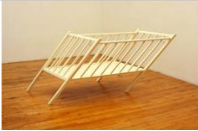
Robert Gober Pitched Crib , 1987 Enamel paint on wood 38 1/4 x 73 1/4 x 50 1/2 in (97 x 186 x 128 cm)