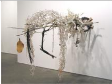
Elliot Hundley Garland , 2007 Wood, plastic, paper, pins, porcelain, ceramics, wire, string, glue, primer, spray paint, silk, Red Chinese coral, magnifying lenses, and found objects 64 x 92 x 55 in (163 x 234 x 140 cm)