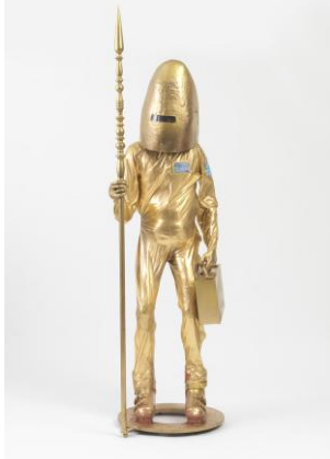
Pawel Althamer Nomo , 2009 Metal, wood, sponge, old clothes, ski boots, and gold paint approximately 90 1/2 x 27 1/2 x 27 1/2 in (230 x 70 x 70 cm)