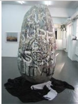
Dan Colen Nostalgia aint what it used to be (The Writing on the Wall) , 2006 Oil, acrylic, paper mache, styrofoam, and polyfoam on medium-density fiberboard and burkhas approximately 94 7/8 x 46 7/8 x 46 7/8 in (Approx. 241 x 119 x 119 cm)