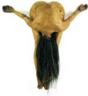
Kiki Smith Untitled (Bowed Woman) , 1995 Brown wrapping paper, Methyl-cellulose, and horse hair 53 x 18 x 50 in (134.6 x 45.7 x 127 cm)