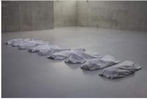
Maurizio Cattelan All , 2007 White Carrara marble 9 parts each: 11 7/8 x 39 3/8 x 78 3/4 in Overall: 11 7/8 x 78 3/4 x 339 1/2 in (9 parts, 30 x 100 x 200 cm each)