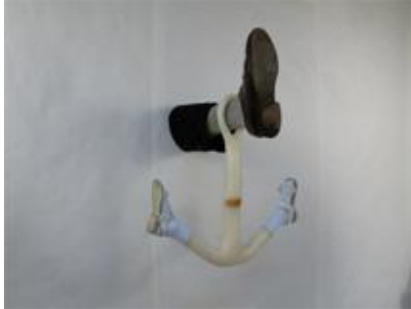
Robert Gober Untitled , 2009 Beeswax, cotton, leather, aluminum, pull tabs, human hair, and oil paint 28 x 22 x 19 3/4 in (71 x 56 x 50 cm)