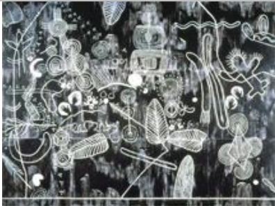
Mike Kelley Cave Painting , 1984 Synthetic polymer on twelve sheets of paper each, 8 5/8 x 48 in; overall, 144 x 192 in (each, 22 x 122 cm; overall, 365.8 x 487.7 cm)