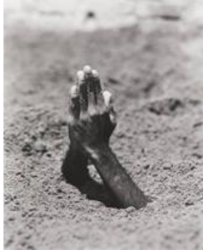
Maurizio Cattelan Mother , 1999 Gelatin silver print 39 3/8 x 44 3/4 in (100 x 114 cm)