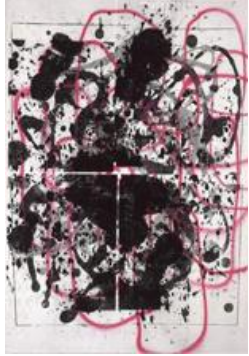
Christopher Wool Untitled , 2000 Enamel on linen 108 x 72 in (274.3 x 182.9 cm)