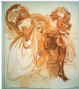
Kara Walker Pegged , 1996 Gouache on paper framed, 64 1/2 x 56 1/4 in (framed, 143 x 164 cm)