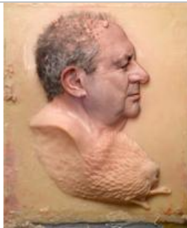
Roberto Cuoghi Megas Dakis , 2007 Print on cotton paper Framed, 28 3/4 x 25 in (73 x 64 cm)