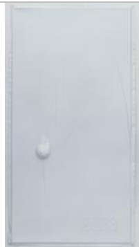
Seth Price Untitled (White Breast) , 2008 Vacuum formed high impact polystyrene 96 x 48 in (244 x 122 cm)