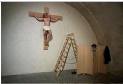
Pawel Althamer Schedule of the Crucifix , 2005 Oak wood, leather, and metal with performance Dimensions variable