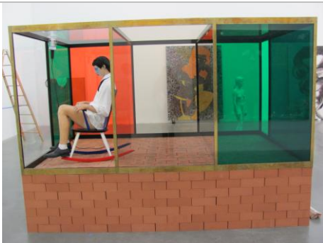
Andro Wekua Wait to Wait , 2006 Wax figure, lacquered aluminum, clear and colored glass, brazen aluminium, bricks, motor, collages, and felt pen and pencil on paper 78 3/4 x 82 5/8 x 118 1/8 in (200 x 210 x 300 cm)