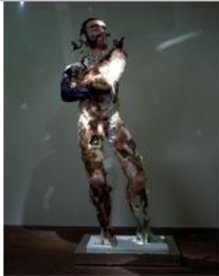
David Altmejd The Giant , 2006 Foam, resin, paint, fake hair, wood, glass, decorative acorns, and taxidermy of three fox squirrels and four grey squirrels 114 1/8 x 59 7/8 x 40 1/8 in (290 x 152 x 102 cm)