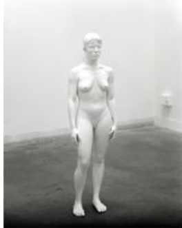
Charles Ray Aluminum Girl , 2003 Aluminum and paint 62 1/2 x 18 1/2 x 11 1/2 in (158.8 x 47 x 29.2 cm)