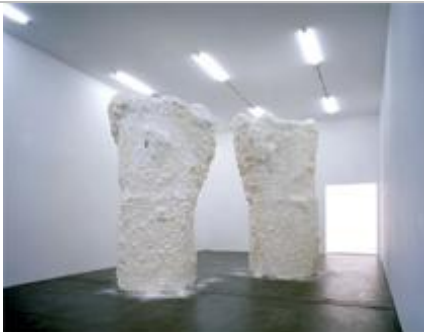
Terence Koh Untitled (Chocolate Mountains) , 2006 Mixed media sculpture: styrofoam, fiberglass, and white chocolate icing 141 3/4 x 70 7/8 in (360 x 180 cm) (2 parts)