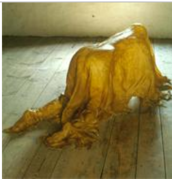
Janine Antoni Saddle , 2000 Full rawhide 25 1/2 x 32 1/2 x 78 1/2 in (65 x 83 x 199 cm)