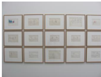
Christiana Soulou Water , 1982-85 Pencil, watercolor, and wax crayon on paper 53.5 x 41.5 x 4.5 cm each