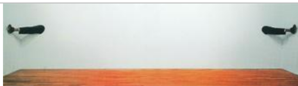
Robert Gober Two Spread Legs , 1991 Wood, wax, leather, cotton, human hair and steel 11 x 35 x 27 1/5 in (27.9 x 88.9 x 69.8 cm)