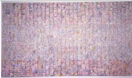
Richard Prince I'm in a Limousine (Following a Hearse) , 2005-06 Acrylic on canvas, and cancelled checks 112 1/8 x 200 in (284.8 x 508 cm)