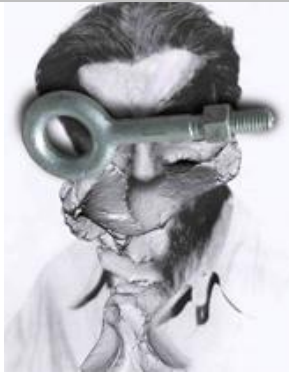
Urs Fischer Noodles , 2009 Oak, aluminum composite panel, screws, gesso, ink, and acrylic 96 x 72 x 1 1/4 in (243.8 x 182.8 x 3.1 cm)