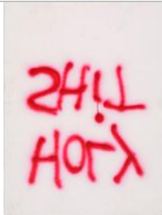
Dan Colen Holy Shit (Mirror) , 2006 Oil on wood 48 x 35 1/2 in (90 x 122 cm)