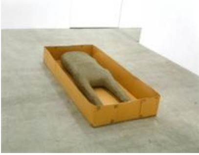
Mark Manders Wednesday Box , 2002 Mixed mediums 85 7/8 x 39 3/8 x 11 7/8 in (218 x 100 x 30 cm)