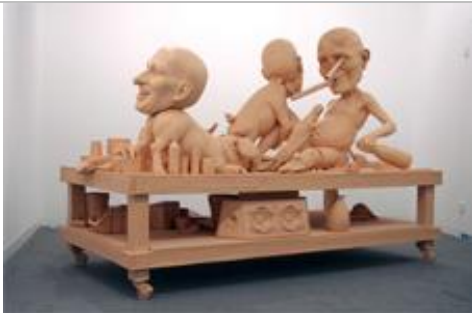
Paul McCarthy Paula Jones , 2007 Fiberglass 82 x 57 1/2 x 107 in (208.3 x 146 x 271.8 cm)