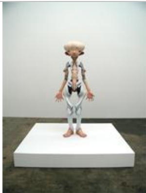
Takashi Murakami Inochi , 2004 Fiberglass, resin, and iron 55 1/8 x 24 5/8 x 14 3/8 in (140 x 62.5 x 36.5 cm)