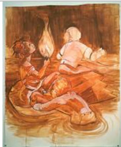
Kara Walker Allegory , 1996 Gouache on paper 63 3/4 x 51 1/2 in (162 x 131 cm)