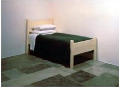
Robert Gober Corner Bed , 1987 Enamel paint, cotton, and wood 43 3/4 x 76 3/4 x 41 3/8 in (111 x 195 x 105 cm)