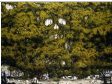
Nigel Cooke Silva Morosa , 2002-03 Oil on canvas 72 x 96 in (183 x 244 cm)