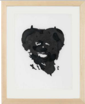
Adam Helms Untitled , 2006 Ink on mylar 14 1/2 x 12 in (37 x 30 cm)