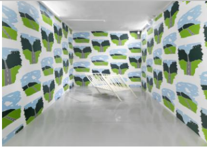
Robert Gober Highway , 1979-2007 Hand-printed silkscreen on paper Dimensions variable