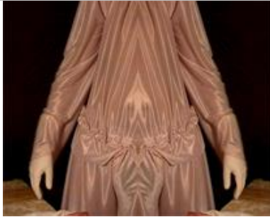
Haris Epaminonda Nemesis 52 , 2003 Video, 13:07 min