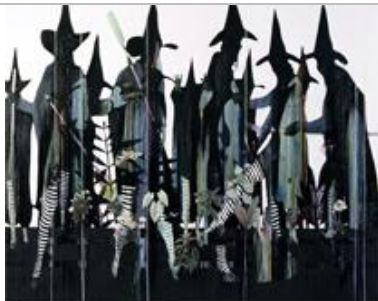
Matt Greene That We Do Not Appear to Fly is of Little Consequence , 2006 Acrylic, ink, and collage on canvas 96 x 120 in (244 x 305 cm)