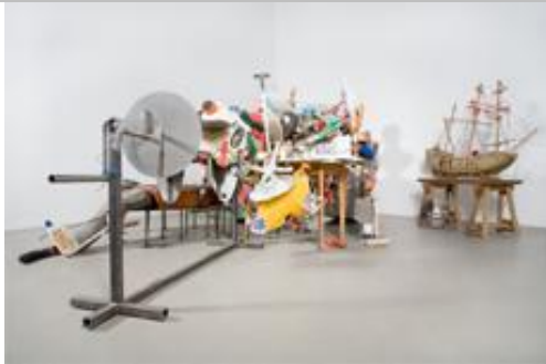
John Bock Maltratierte Fregatte , 2006-07 Installation of mixed mediums, dimensions variable; video Maltratierte Fregatte , 66:41 min; and video Untergang der Medusa , 9:37 min