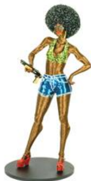
Liza Lou Super Sister , 1999 Cast polyester resin and glass beads Height: 82 3/4 (210 cm)