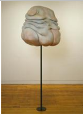
Ashley Bickerton F.O.B. , 1993 Fiberglass, enamel paint, and steel 82 x 31 x 29 in (208 x 79 x 74 cm)