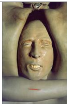
Cindy Sherman Untitled (Head) , 1995 Cibachrome Print 49 1/2 x 72 1/2 in (125.7 x 184.1 cm)