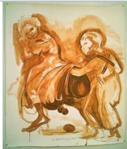
Kara Walker Leaving the Scene , 1996 Gouache on paper 59 5/8 x 51 1/2 in (155.5 x 131 cm)