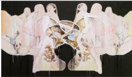
Matt Greene The Orifice , 2006 Oil, acrylic, enamel, and graphite on canvas 70 x 120 in (178 x 305 cm)