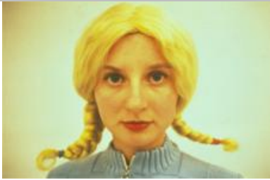
Vanessa Beecroft Ein Blonder Traum , 1994 2 Hi8 tapes, 2 VHS tapes, and 13 polaroids