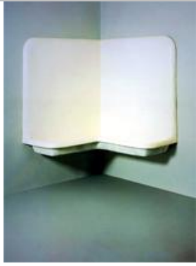
Robert Gober The Scary Sink , 1985 Enamel paint on plaster, wire lathe, wood, and steel 62 1/4 x 55 1/5 x 55 1/2 in (158 x 141 x 141 cm)