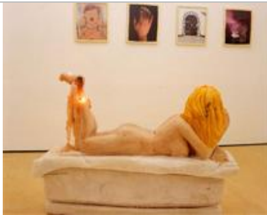
Urs Fischer What if the Phone Rings , 2003 Polychromed wax 41 3/4 x 56 x 18 1/8 in (106 x 142 x 46 cm)