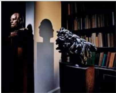
Tim Noble & Sue Webster Black Narcissus , 2006 Black poly-sulphide rubber, wood, and light projector sculpture, 15 x 28 3/8 x 23 5/8 in; plinth, 12 x 12 x 36 in (sculpture, 38 x 72 x 60 cm; plinth, 30.5 x 30.5 x 91.5 cm)