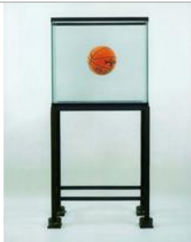
Jeff Koons One Ball Total Equilibrium Tank , 1985 Glass, iron, water, and basketball 64 1/2 x 30 1/2 x 13 1/4 in (164 x 77 x 34 cm)