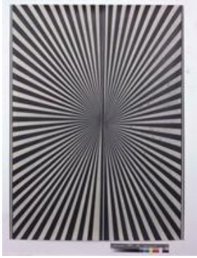
Mark Grotjahn Untitled (Creamsicle 681) , 2007 Colored pencil on paper 64 1/2 x 47 3/4 in (164 x 121 cm)