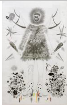
Jannis Varelas My dad is stronger than yours, Rainbow Rocket Bill and Friend , 2005 Pencil, charcoal, oil, glitter, and collage on paper 92 1/2 x 59 in (235 x 150 cm)