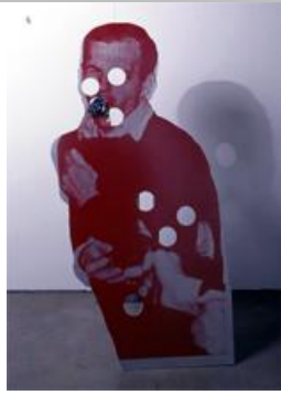
Cady Noland Bluewald , 1989 Screen print on aluminum, and printed cotton flag 72 x 33 1/2 x 35 1/2 in (183 x 85 x 90 cm)