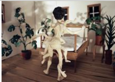
Nathalie Djurberg It's the Mother , 2008 Video with music by Hans Berg, 6 min