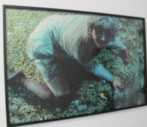
Cindy Sherman Untitled (Stones) , 1985 Cibachrome Print 49 1/2 x 72 1/2 (125.7 x 184.1 cm)