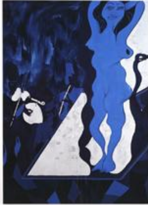
Chris Ofili Thirty Pieces of Silver , 2006 Oil, acrylic, and charcoal on canvas 109 5/8 x 78 7/8 in (278.4 x 200 cm)