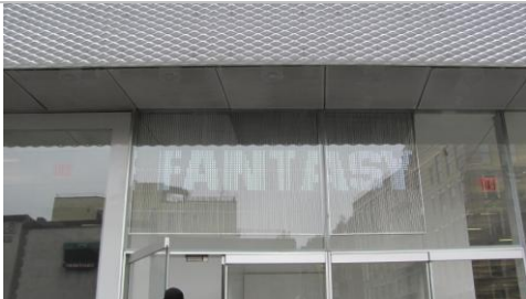
Jenny Holzer Selections from the Survival Series , 1984 LED sign 6 x 60 x 7 in (15 x 152 x 18 cm)