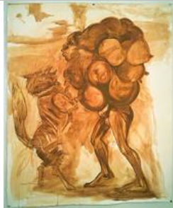
Kara Walker B'Erer , 1996 Gouache on paper 63 x 51 1/2 in (160 x 131 cm)