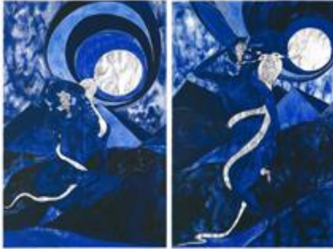
Chris Ofili Blue Damascus , 2004 Charcoal, gouache, ink, and aluminum on paper framed, 88 1/2 x 61 3/8 x 2 in (framed, 224.9x 155.9 x 5 cm)