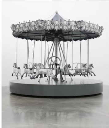
Charles Ray Revolution Counter-Revolution , 1990/2010 Carved wooden elements, steel, fabric and mechanical elements 115 x 164 x 164 in (292.1 x 416.5 x 416.5 cm)