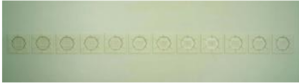
Matthew Barney Cremaster 1 Choreographic Suite , 1996 Acrylic, Vaseline and pencil on paper, with vinyl floor tile, and patent vinyl within self-lubricating plastic frames Each: 18 3/4 x 17 1/2 x 2 3/4 in (48 x 45 x 7 cm)