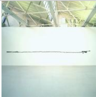
Kiki Smith Intestine , 1992 Cast bronze 360 x 8 1/8 x 12 in (914.4 x 20.8 x 30.5 cm)