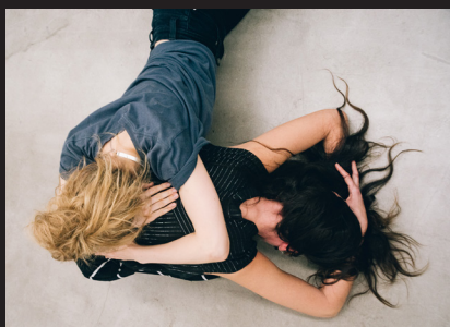
"Alexandra Pirici: Aggregate," 2017. Exhibition view: Neuer Berliner Kunstverein, Berlin.