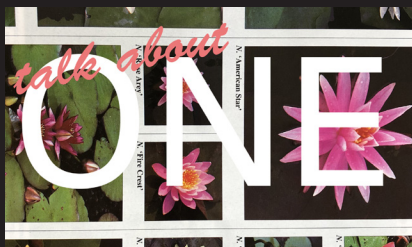
Sara Magenheimer, Break Up Song , 2018 (still). HD video, color; 5:26 min.