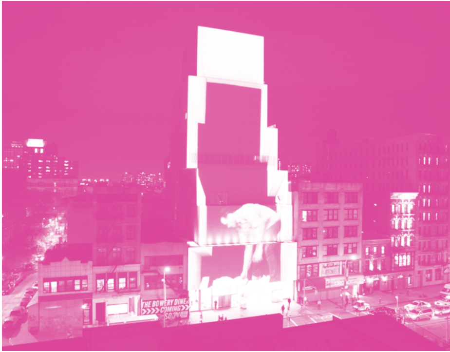
Nuit Blanche New York commissioned artist projections for the façade of the New Museum for the Festival in May 2011