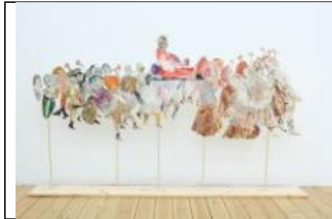
Beginning of Populism, 2017 Pencil, paint, and encaustic on paper 45 1/2 x 78 3/4 in (115.5 x 200 cm) Courtesy the artist and Sfeir-Semler Gallery, Hamburg/Beirut