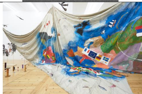
Sail, 2017 Sail with four birds, paint, cotton, plaster, wax, and muslin Dimensions variable Private collection