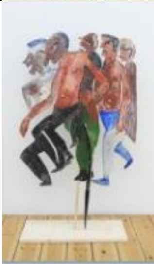
Untitled, 2017 Pencil, paint, and encaustic on paper 40 3/4 x 22 1/2 in (103.5 x 57 cm) Courtesy the artist and Sfeir-Semler Gallery, Hamburg/Beirut