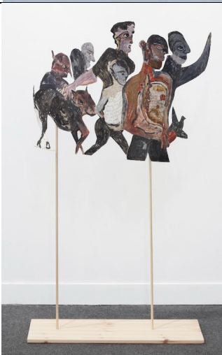
Untitled, 2016 Pencil, paint, and encaustic on paper 44 1/4 x 30 3/4 in (112.5 x 78 cm)