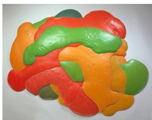
Night Sherbert A