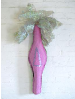
Lagniappe I (Pink/Green Hair)