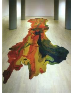
Contraband 1969 Pigmented latex 116 1/4 x 394 1/3 x 3 in 295.3 x 1001.6 x 7.6 cm Whitney Museum of American Art; purchase, with funds from the Painting and Sculpture Committee and partial gift of John Cheim and Howard Read 2008.14 © Lynda Benglis. DACS, London/VAGA, New York 2009.