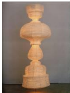
The Manu Light Vessel I 2009 Paper, wood, electric bulbs and wire 90 x 36 x 36 in 228.5 x 91.5 x 91.5 cm Courtesy of the artist and Cheim & Read, New York