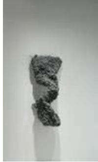
Ghost Shadow III