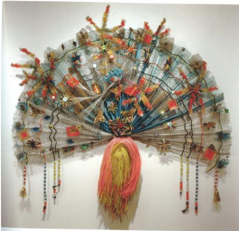
Zanzidae, from the Peacock series