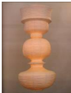
The Manu Light Vessel III 2009 Paper, wood, electric bulbs and wire 72x 36 x 36 in 182.9 x 91.5 x 91.5 cm