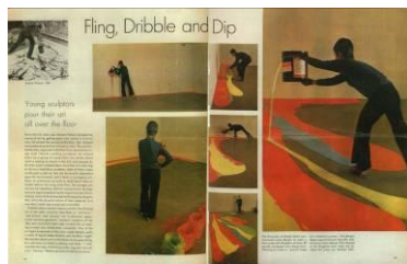
"Fling, Dribble, and Dip"