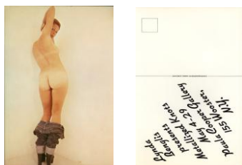
Paula Cooper Gallery Announcement