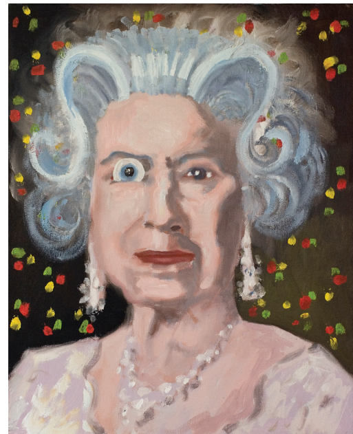
George Condo, The Insane Queen , 2006. Oil on canvas, 20 x 16 in (50.8 x 40.6 cm). Collection Per Skarstedt

New York, New York... Since first bursting onto the scene in the early 1980s with his unique adaptation of the language of Old Master painting, George Condo has created one of the most adventurous, imaginative, and provocative bodies of work in contemporary art. Condo's work has been deeply influential to two generations of American and European painters, who have felt the impact of the artist's astonishing technical ability, stylistic versatility, and inventive subject matter. This January, the New Museum will present " George Condo: Mental States ," the first major US survey of over eighty paintings and sculptures from the past twenty-eight years of the artist's career. Condo is famously prolific, and this tightly edited selection of works from 1982 to the present responds to his prodigious output with a unique conceptual approach. The exhibition is organized thematically and stylistically in "chapters" developed in close collaboration with the artist. Highlighting the breadth of Condo's artistic exploration, the exhibition will focus on the specific ideas to which he has returned throughout his career, particularly his ongoing investigation of human physiognomy and its capacity to convey varied "mental states."