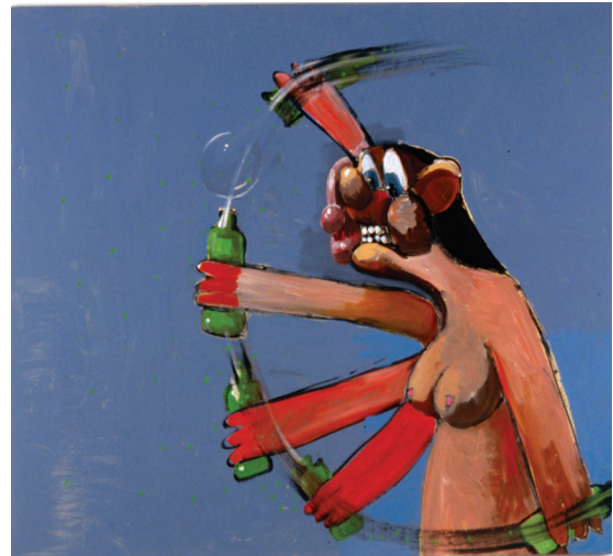
George Condo, Nude Homeless Drinker , 1999. Oil on canvas, 72 x 65 in (182.9 x 165.1cm). Private Collection

“George Condo: Mental States” will be arranged in four groupings over two gallery floors of the New Museum. A dramatic installation of more than fifty portraits demonstrating a variety of styles and subjects will be featured in the soaring fourth-floor gallery as a centerpiece of the exhibition. This “portrait wall,” hung salon-style, will be populated by invented characters that often assimilate and appropriate elements from masterpieces by the greatest Western artists of the past 500 years, from Velázquez to Picasso to Arshile Gorky. This collection of imaginary characters is a blend of recognizable figures and archetypes rendered in Condo’s particular form of artificial realism: butlers, businessmen, saints, and historical figures are familiar in spite of their often fantastic or humorously grotesque features. Complementing the portrait wall will be a series of sixteen patinated gold sculptures.