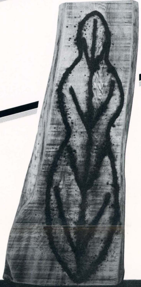
△ Ana Mendieta, UNTITLED, 1985. Retrospective exhibition in the main gallery.