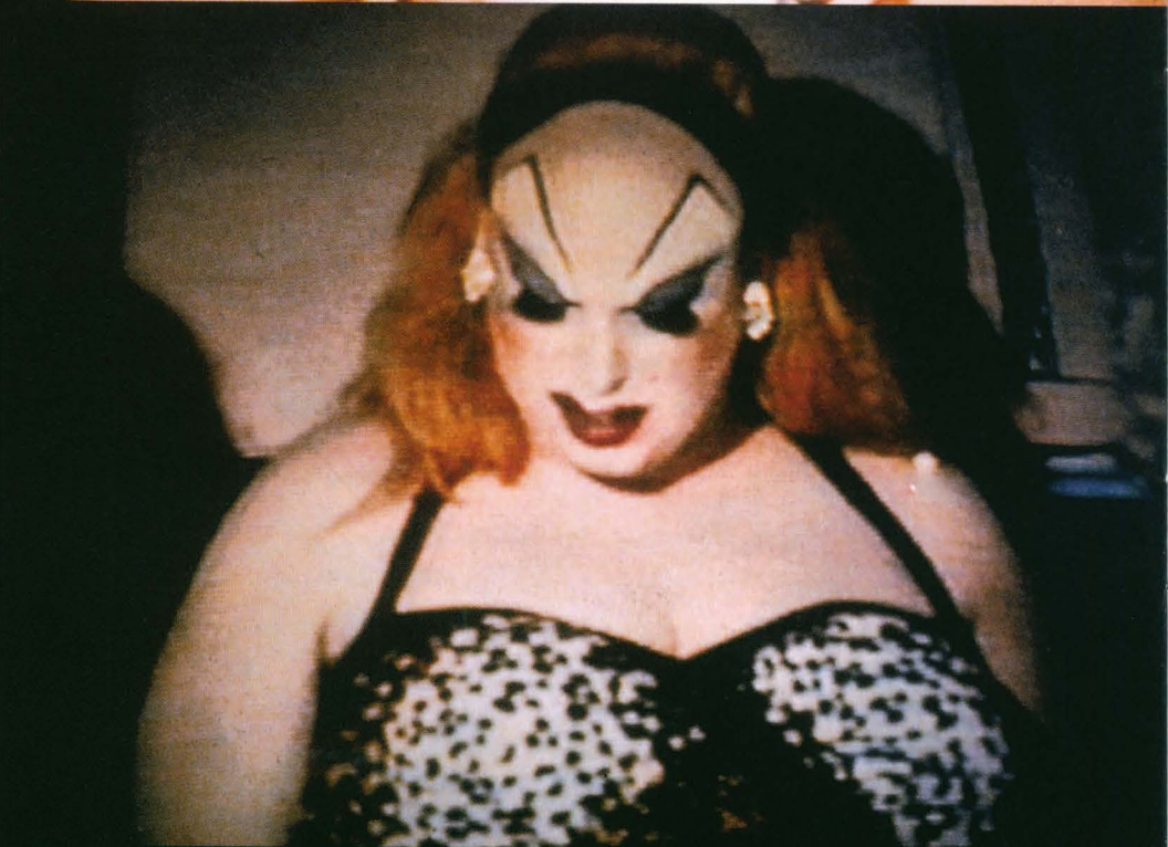
1 John Waters Manson Copies Divine's Hairdo (1993)

Additional support is provided by the Judith Rothschild Foundation.