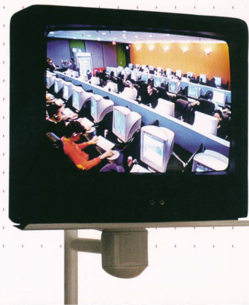
1 Marco Brambilla HalfLife (2002). Installation detail