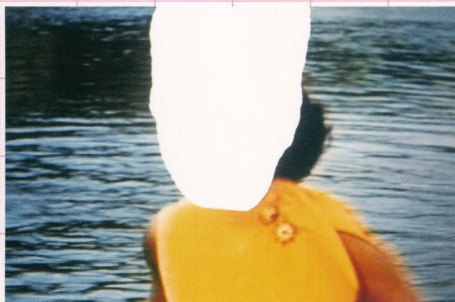
above John Waters Sophia Loren Decapitated (1998). Detail

JOHN WATERS: CHANGE OF LIFE OPENS Sun.8 12PM (All Galleries)