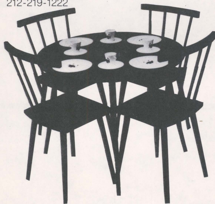
Katharina Fritsch, Schwarzer, runder Tisch mit vier Stühlen , 1985. From the exhibition, A Distanced View .

583 Broadway New York, N.Y. 10012 212-219-1222