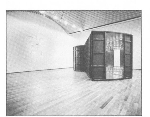
Yukinori Yanagi, Hinomaru Container, steel, mirror, plywood, lightbulbs, neon tubes, 1992; Tokyo Diagram , acrylic on wall, 1992 Installed at Setagaya Museum, Tokyo.

Gina Denta co-curator and cultural critic