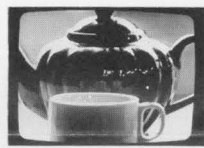
David Perry, Interior with Views, 1975/6 . Video still from 5-minute videotape included in Satellite Cultures .