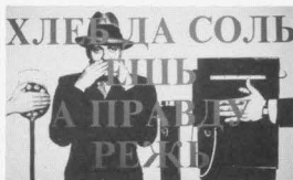
Annette Lemieux, Truth, 1989 . Latex and acrylic on canvas.

Because seating is limited, reservations are suggested and can be made by calling the offices. Funding for this program was provided in part by the Australian Film Commission.