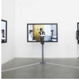
The Propeller Group TVC Communism, 2011 Five-channel synchronized video installation and LED monitor, color, sound; 5:45 hr (loop) Courtesy the artists