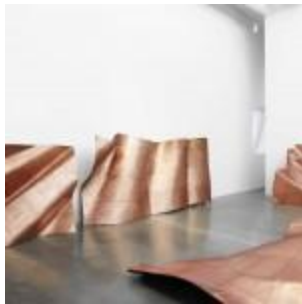
Danh Võ WE THE PEOPLE, 2011 Pounded copper Courtesy the artist and Galerie Chantal Crousel, Paris