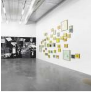
Kemang Wa Lebulere Remembering the Future of a Hole as a Verb 2, 2012 Chalk, drawings, and photographs on paper