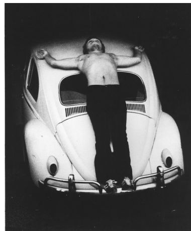
Trans-fixed Venice, California; April 23, 1974 Inside a small garage on Speedway Avenue, I stood on the rear bumper of a Volkswagen. I lay on my back over the rear section of the car, stretching my arms onto the roof of the car. The garage door was opened and the car was pushed half-way out into the Speedway. Screaming for me, the engine was run at full speed for two minutes. After two minutes, the engine was turned off and the car pushed back into the garage. The door was closed.

Major support is also provided by The Andy Warhol Foundation for the Visual Arts, Lonti Ebers and Bruce Flatt, Gagosian Gallery, and the National Endowment for the Arts.